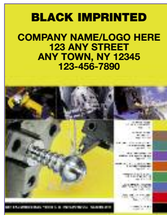
CUSTOM BLACK IMPRINTED COVER