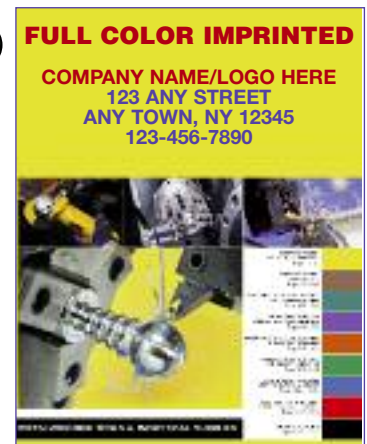
CUSTOM FULL COLOR IMPRINTED COVER